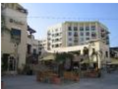
Old town Pasadena, with its restaurants, shopping, hotels, and other attractions, surrounds the Conference Center.

Register early to assure the space you want at what promises to be one of the largest astronomical exhibits in the country! We will be working with the convention center and others to provide a wonderful place for you to show off and sell your products.