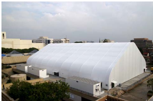
The East Pavilion of the Pasadena Convention Center will be home to the premier Pacific Astronomy and Telescope Show. This air conditioned, carpeted building has room for 80 or more vendors, catering, demonstration areas, and the perfect atmosphere for showing off products. It is immediately adjacent to the Conference Center, with rooms for general and breakout sessions featuring some of the top names in amateur astronomy.

You will want to reserve a booth or two to display your wares, demonstrate your products, and ring up a few sales in this environment. To do so, you can just review the information on page two of this brochure, and send in your registration.